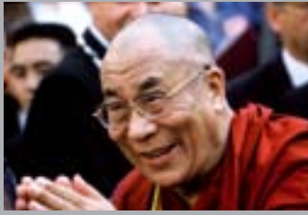
His Holiness the Dalai Lama